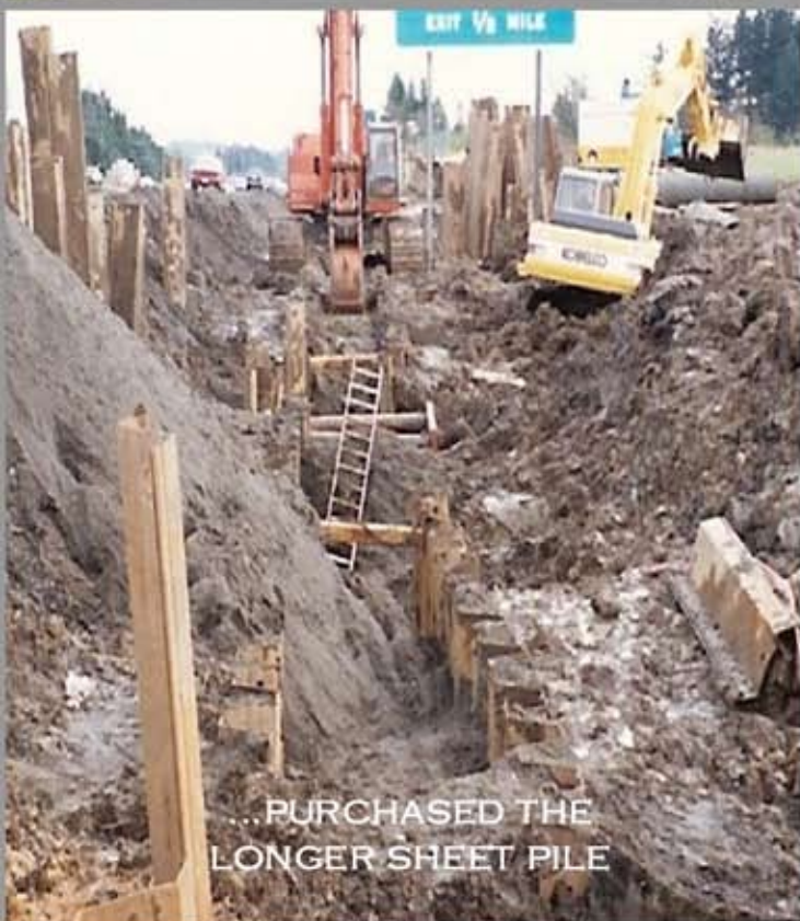
...PURCHASED THE LONGER SHEET PILE