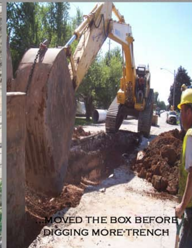
...MOVED THE BOX BEFORE DIGGING MORE TRENCH

Salt Lake City, Utah - 801-255-5959 national-welding.com