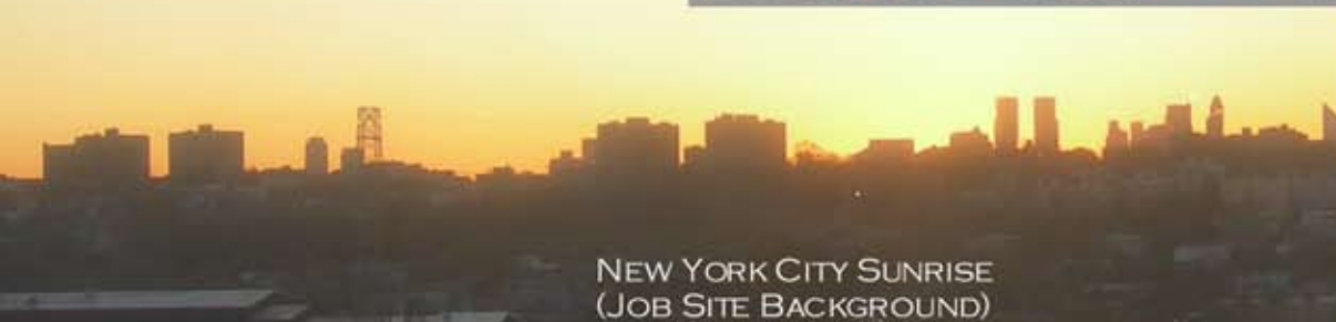
NEW YORK CITY SUNRISE (JOB SITE BACKGROUND)