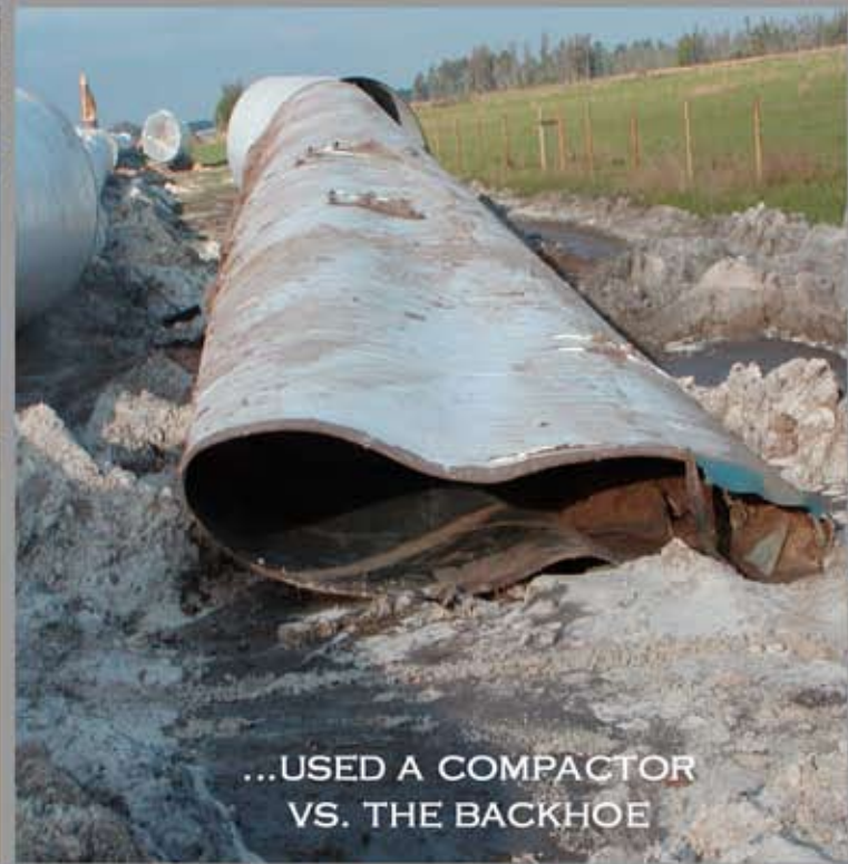
...USED A COMPACTOR VS. THE BACKHOE