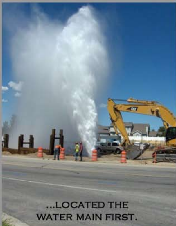
...LOCATED THE WATER MAIN FIRST.